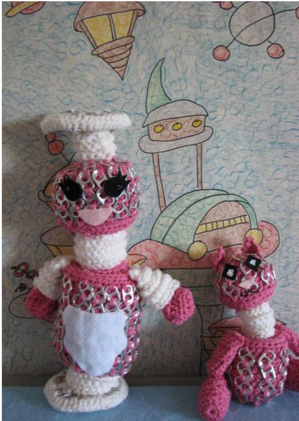
With Robot Kitty!