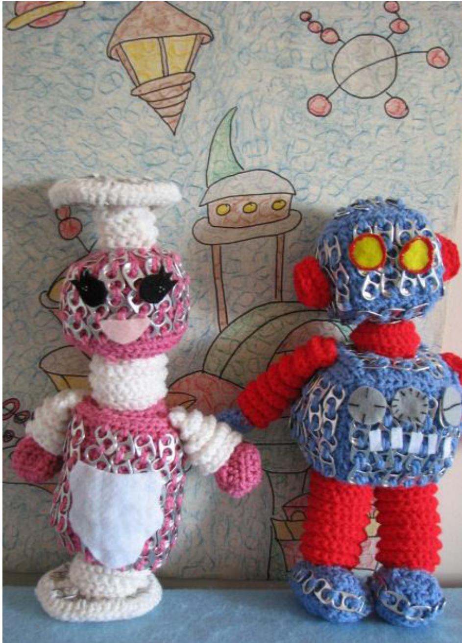
Pop Tab Mrs Robot is in Love